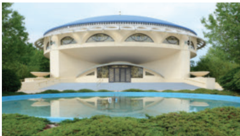
Annunciation Greek Orthodox Church Frank Lloyd Wright