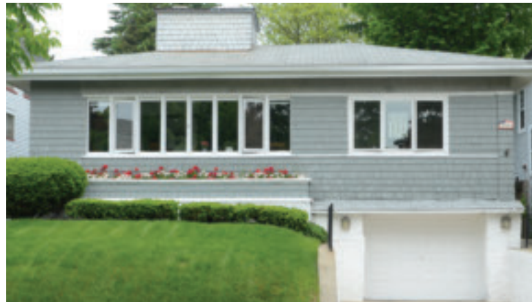
Elizabeth Murphy House Frank Lloyd Wright