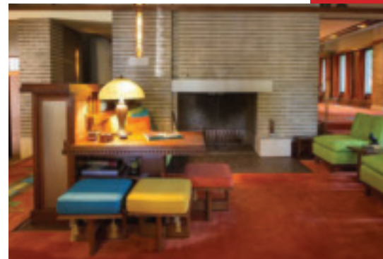
BOGK HOUSE Milwaukee Sentinel Journal, Oct. 13, 2016.

Limited to 75 attendees. Advance reservations are required.