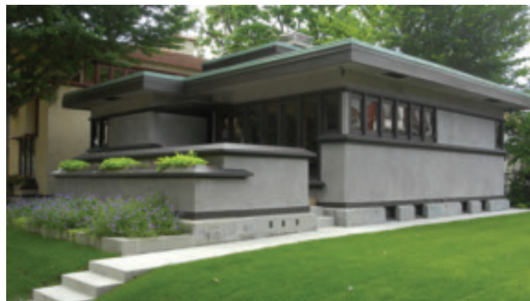
American System-Built Home Model B1 Frank Lloyd Wright