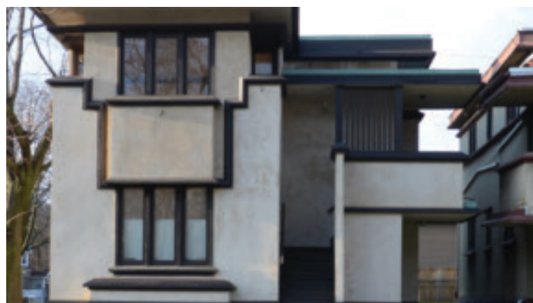
American System-Built Home Two Flat Model C Frank Lloyd Wright